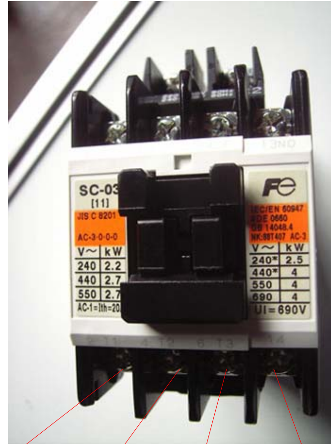
3 Pole Contactor details